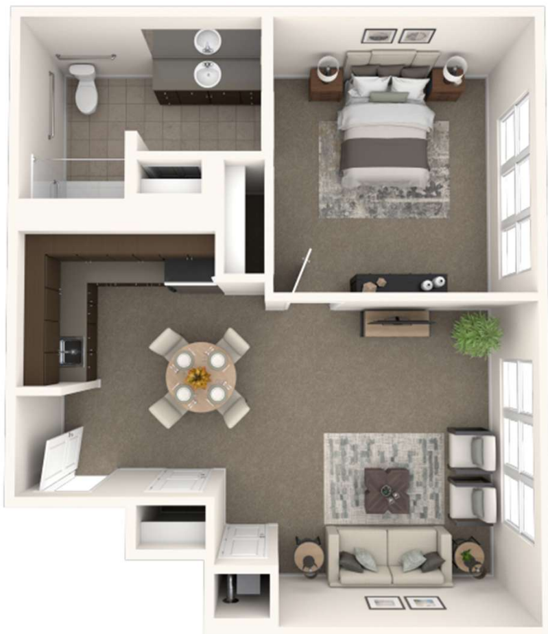
1 BDRM/1 Bath – 658 square feet